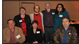
ALS Clients & Families