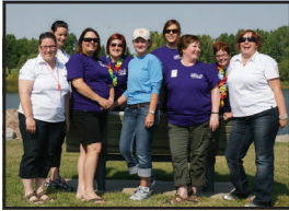
Lethbridge WALK for ALS