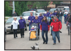
Spruce Grove WALK for ALS