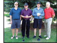
Charitee Golf Tournament