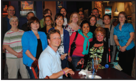
42 Canoe dinner in Edmonton